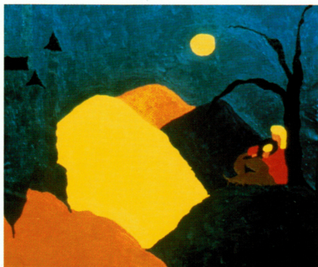
Il Vecchio Castello