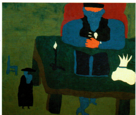
Two Polish Jews. One Rich. One Poor