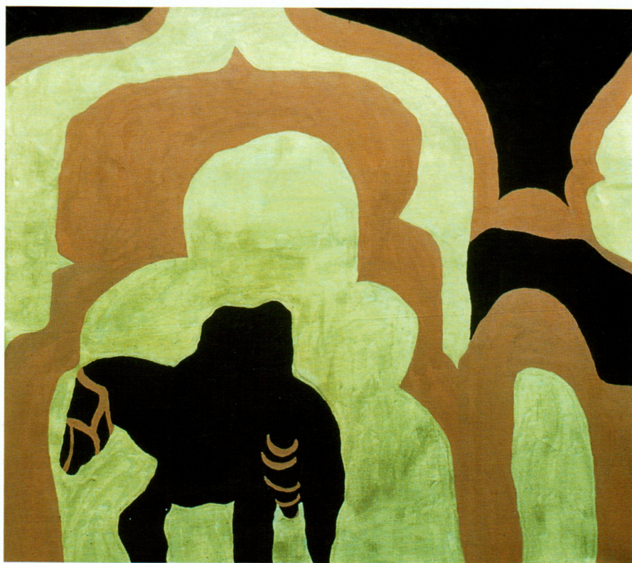
The Great Gate of Kiev