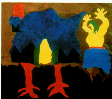
The Hut of the Baba Yaga