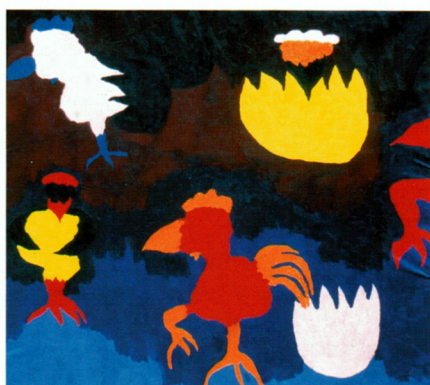
Ballet of the Chicks within their Shells